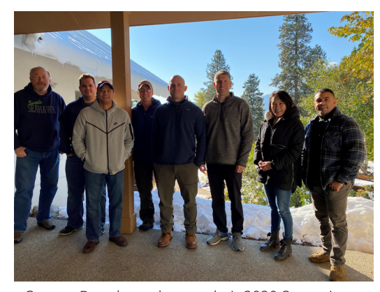
Current Board members at their 2020 Strategic Planning Weekend.