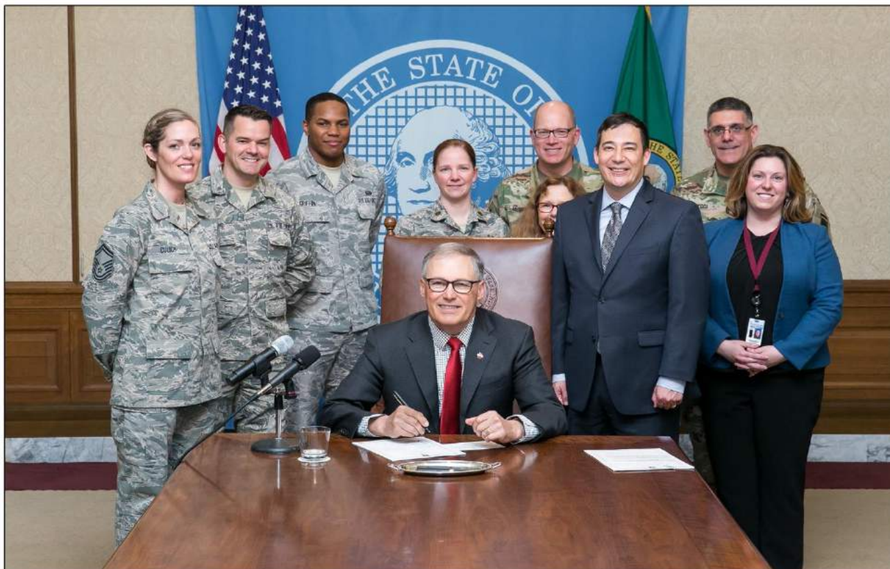
Gov. Jay Inslee signs Senate Bill No. 5826, April 25, 2017. Relating to eligibility for veteran or national guard tuition waivers. Primary Sponsor: Steve Hobbs